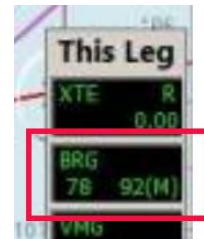
OpenCPN Active Route Console. Waypoint bearing 078(T) and 092(M). So Variation in area is 14W

However a GPS is extremely good at providing a bearing from its current position to the next waypoint, which you should be able to access (in OpenCPN it is part of the Active Route Console Window). And it can likely even give you the magnetic bearing (check your GPS manual for details – for OpenCPN you need to select show magnetic and activate the WMM plugin – screen capture to right). If you place your next waypoint on a landmark a few miles away, but still identifiable from your current position and then steer directly towards it, the difference between the GPS's waypoint bearing (corrected to magnetic) and your compass course is your deviation for that course. But doing this for courses every 30 degrees is not really practical.